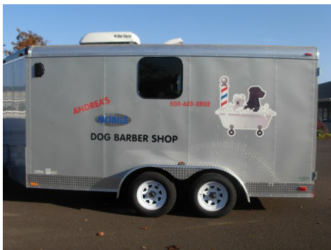
Andrea's Mobile Dog Barber Shop Polk and Yamhill Counties, OR